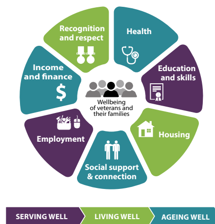
Figure 1: Wellbeing model

We work to enhance the wellbeing of veterans and their families by supporting their transition back to civilian life, providing treatment, enabling rehabilitation for service related conditions, and assisting them to engage in programs with a wellbeing focus.