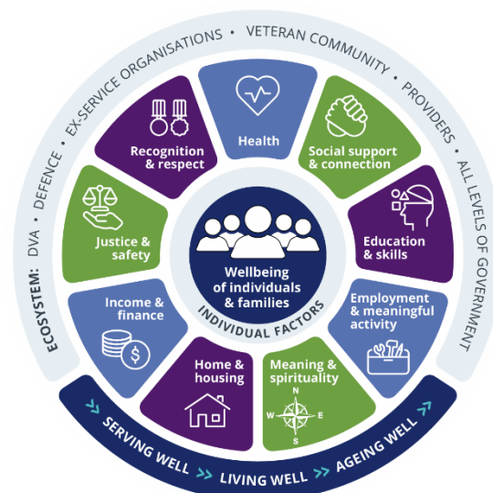
Figure 1: Veteran Wellbeing Framework

Acting with integrity means consistently doing what is right, even when it is difficult or unseen. It requires honesty, accountability, and consistency between words and actions. In the context of DVA's work, integrity means all parties — the department, providers, and veterans — acting in good faith to ensure programs are effective and deliver meaningful support to veterans and their families.